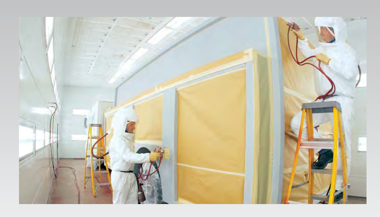
Our custom-designed downdraft paint booths with oven bake systems guarantee the ultimate finish on each truck.