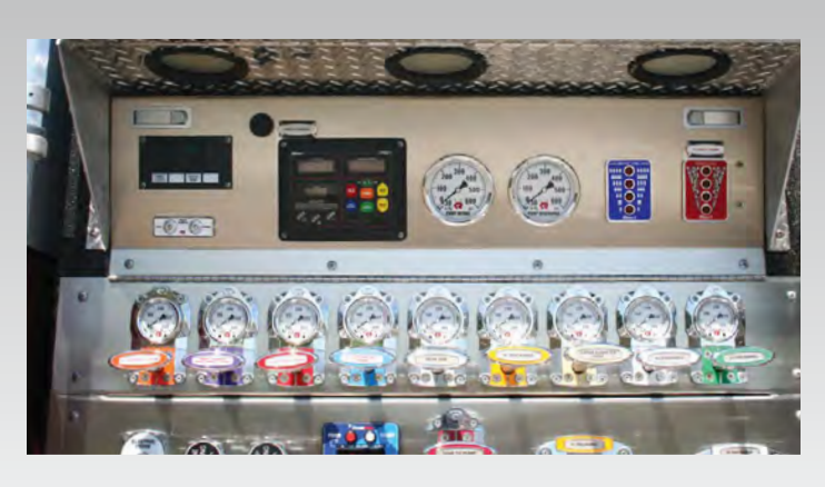
LINE-X and stainless steel control panels offer good visibility, simple operation and easy pump access.