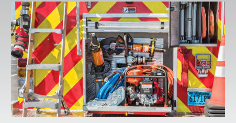
Large equipment storage compartments ensure that everything you need arrives at the scene, right in place.