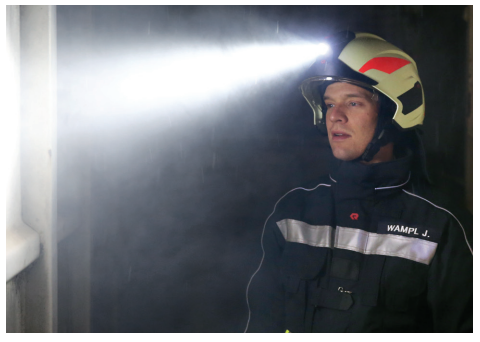
Powerful helmet light (optional)