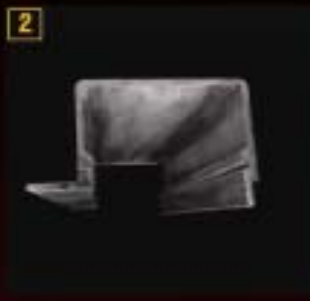
2 Top and Intermediate Door Frame Extrusion