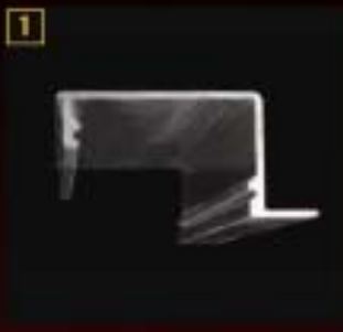
1 Front and Back Door Post Extrusion