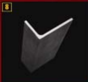
8 Angled Body Outrigger (2" x 3")