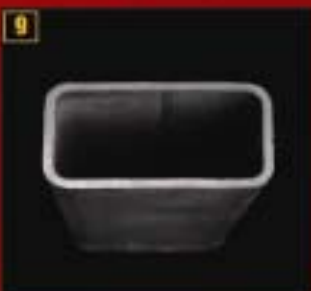
9 Steel Tubing (1.75" x 3")