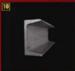
10 Subframe Channel (1.75" x 3")