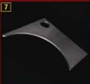
7 Flat Gusset Plate (.375" Steel)