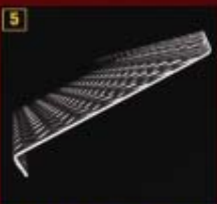
5 .125" Interior Diamond Plate (.190" Optional)