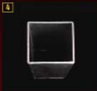
4 Main Framing Extrusion