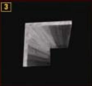
3 Angled Aluminum Body Support Extrusion