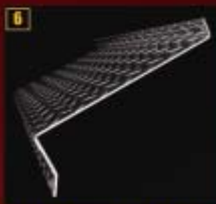
6 .125" Diamond Plate Top Cap (.190" Optional)